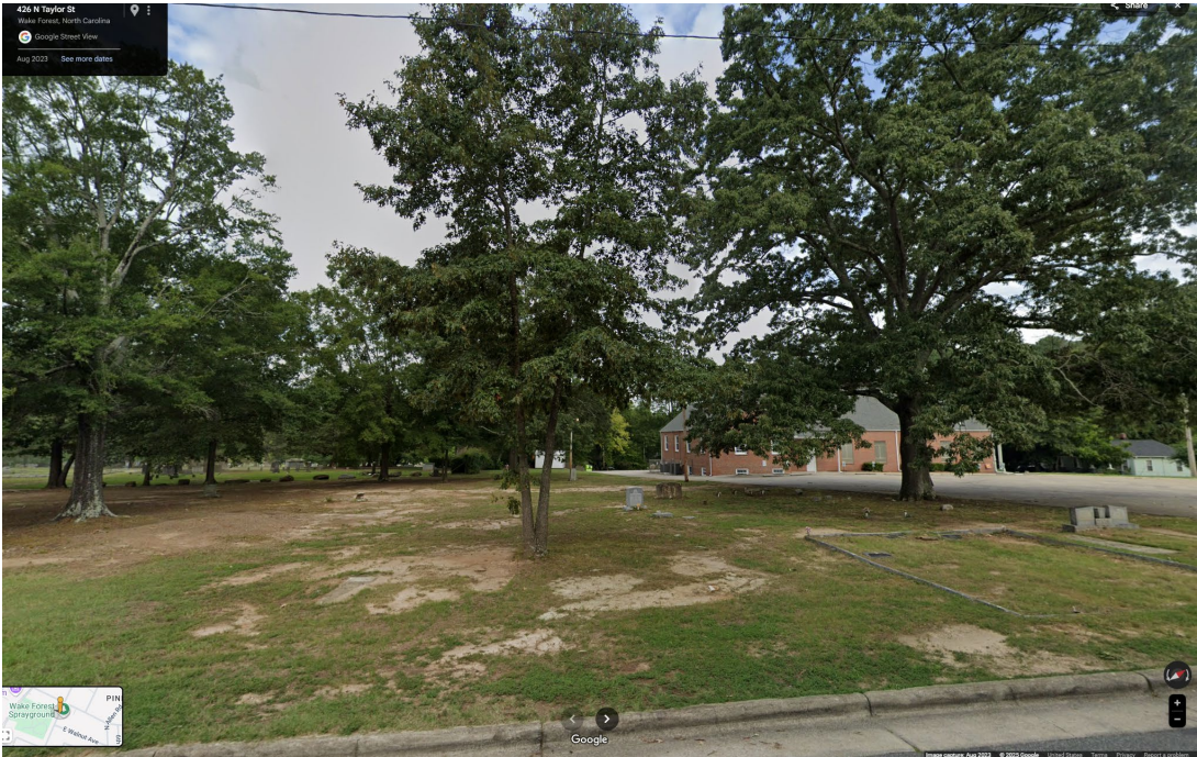
Olive Branch Baptist Church Cemetery