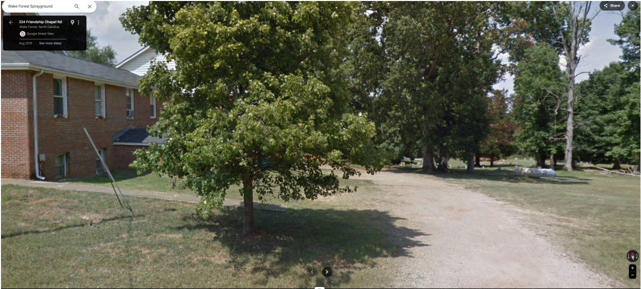
Friendship Chapel Baptist Church Cemetery (beyond the parking area).